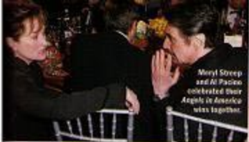
Meryl Streep and Al Pacino celebrated their Angels in America wins together.