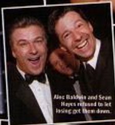
Alec Baldwin and Sean Hayes refused to let losing get them down.