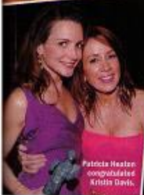
Patricia Heaton congratulated Kristin Davis.