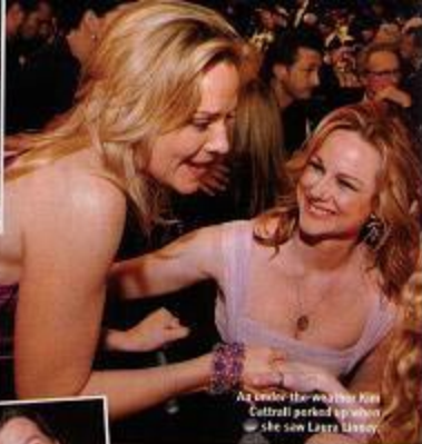
As tender the award, Katie Couric perked up about her son Liana Liberato.