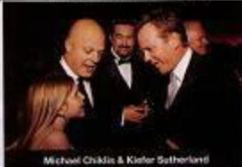
Michael Chiklis & Kiefer Sutherland