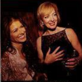
Debra Messing & Allison Janney